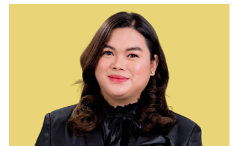
Past DRR Griffins Malazarte